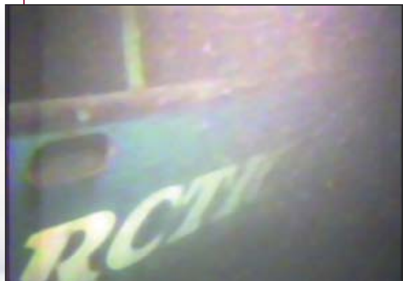
Photograph of the Arctic Rose taken during the remote operated vehicle expedition.

Approximately one hour after receiving the Coast Guard transmission, the Alaskan Rose entered a debris field and the crew spotted someone wearing an immersion suit in the water. They recognized him as the