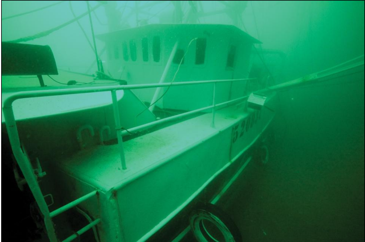
Figure 2. Sunken wreckage of Lady Mary , May 2009.