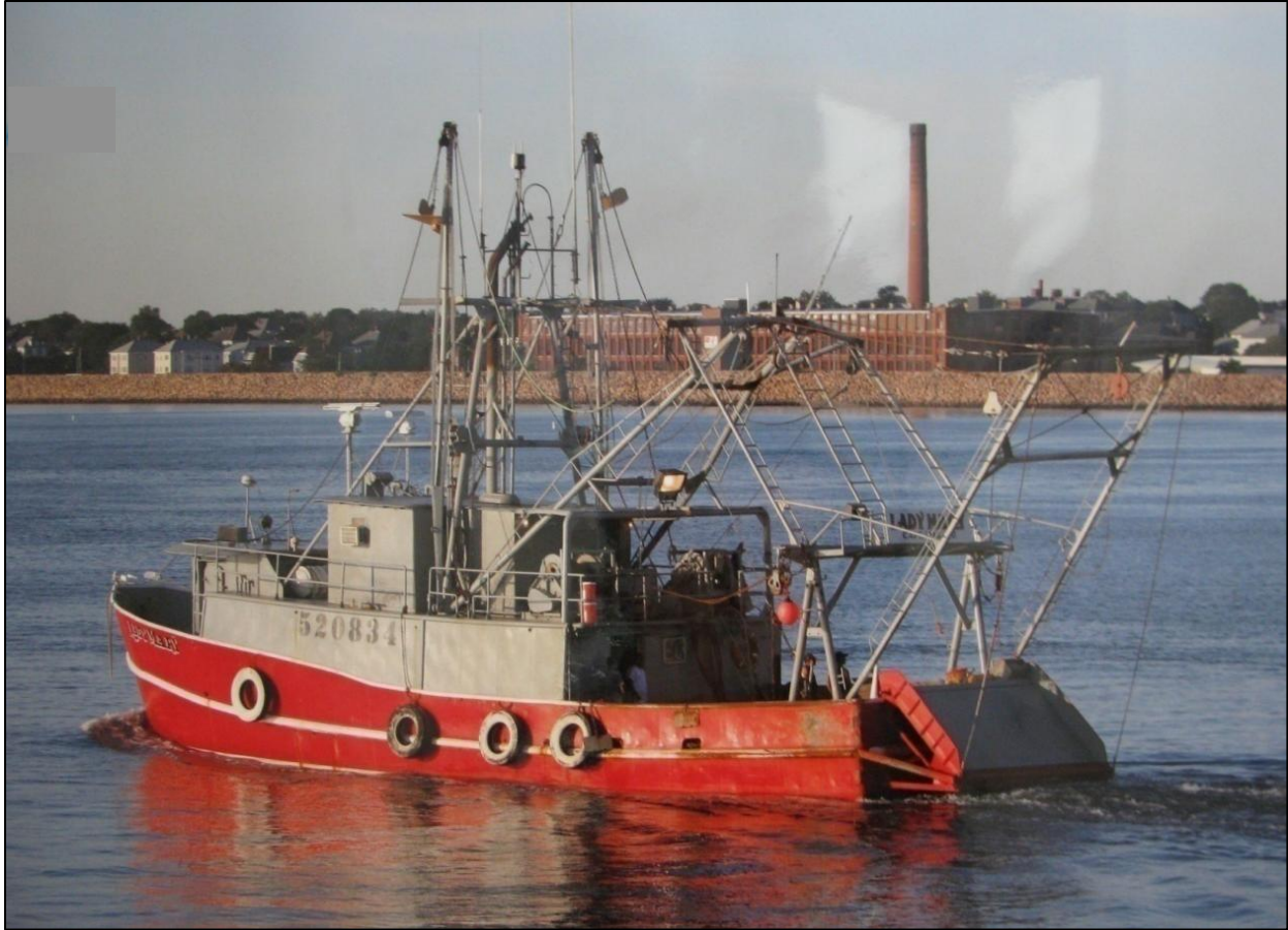
Figure 1. Fishing vessel Lady Mary outbound from New Bedford, Massachusetts, July 2006.

The wreckage was surveyed by divers in May 2009 and extensively photographed (figure 2). In October 2009, the Coast Guard, with the assistance of the U.S. Navy, retrieved the rudder and other equipment from the sunken vessel, which was sent for analysis to the materials laboratory at NTSB headquarters in Washington, DC. As of the date of this brief, the Coast Guard had not published its report on the Lady Mary accident.