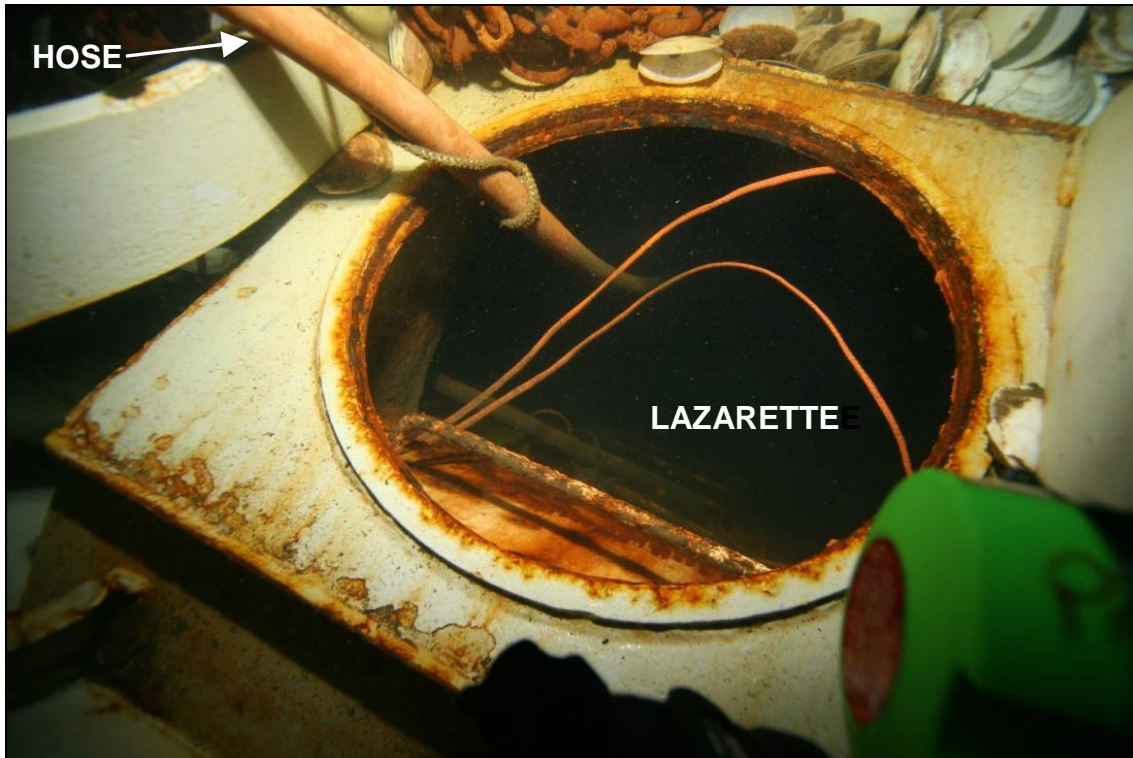
Figure 6. Open access hatch to lazarette, showing hose emerging from inside and tied overboard. A vessel's lazarette is its aftermost compartment below its main deck, typically accessed by a deck hatch.