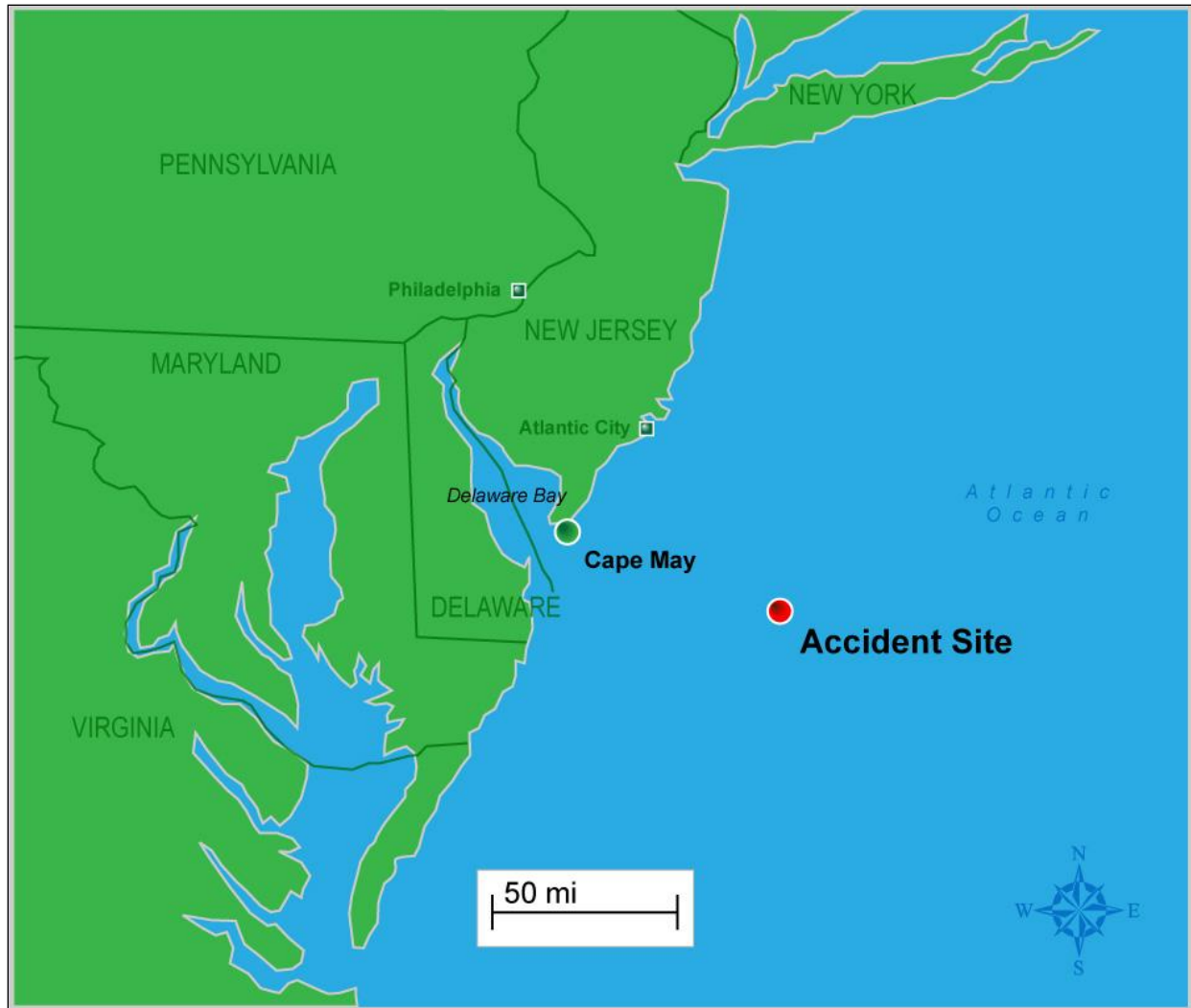
Figure 3. Area of Atlantic Ocean where Lady Mary sank.

At about 0000 on March 24, the sole survivor and another crewmember finished their 18-hour shift and went to bed in the belowdecks bunkroom (refer to figure 4). The survivor told the marine board that everything was normal at the time—the master was steering, the other crewmembers were on deck processing the catch, and the dredge was out, dragging for more scallops. The Lady Mary was proceeding west-northwest at 2–5 knots at that time, according to data from its vessel monitoring system (VMS), 3 which transmitted the vessel’s position every 30 minutes. A speed of 3–5 knots is normal when dredging for scallops, according to an NMFS fisheries management specialist.